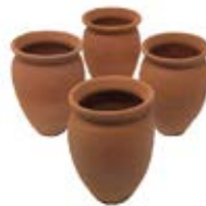
Cantarito Decorative 24pcs CODE: HSW001