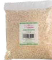
Amaranth 1/2 lb CODE: GRO102