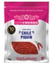
Don Chendo Chile Piquin 15/10g CASE CODE: CHL011-4