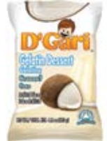
D'Gari gelatina Coconut 24/170g CODE: GRO018