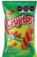
Crujitos 120g CODE: SNK025