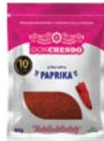
Don Chendo Paprika 10/80g CASE CODE: SEA055-2