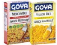
Goya Rice ① Mexican Rice 24/7oz - GRO039 ② Yellow Rice 24/8oz - GRO043