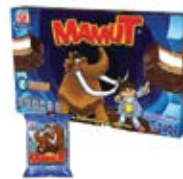
Mamut 8pcs CODE: BKR021-2