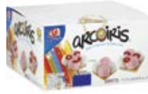
Gamesa Arcoiris 12/15.5 oz CODE: BKR051