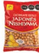
De la Rosa Japones 900g CODE: CAN240