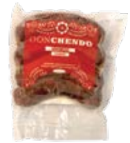
Don Chendo Chorizo Sausage 1 lb CODE: DON100