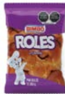
Bimbo Roles de Canela 365g CODE: BKR038