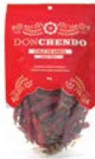
Don Chendo Chile Arbol 15/ 60g CASE CODE: CHL004-6