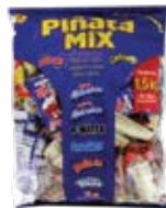
De La Rosa Pinata Mix Chocolate 1.8kg CODE: CAN224