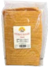
Mi Pueblo Cuadro 11X11 20/10 pc CODE: SNK211