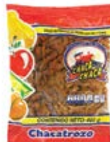
Chaca Chaca Chacatrozo 400g CODE: CAN33