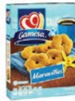
Gamesa Maravillas 8/490g CODE: BKR017