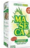
Maseca Corn Flour 10/4 lb CODE: FLR009