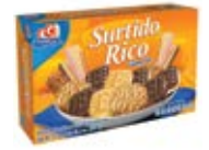
Gamesa Surtido Rico 437g CODE: BKR018