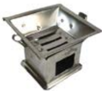
Bracero Mexican Med CODE: HSW089