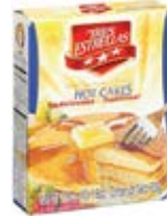
Tres Estrellas Hot Cakes Flour 12/17.6oz CODE: FLR002