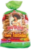
La Vikina Tostada JUMBO