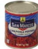
San Marcos Chipotles 24/7oz CODE: CHP012