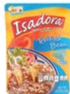
Isadora Original Refried Beans 8/15.2z CODE: BEN004