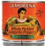
La Morena Jalapeno Whole ① 12/13oz - JAL028 ② 12/28oz - JAL030 ③ 24/7oz - JAL029