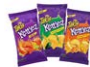
Barcel Chips Artisan Style 12/8oz 1 Fuego - SNK006 2 Habanero - SNK007 3 Jalapeno - SNK008