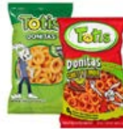
TOTIS 24/50g 1 Chile y Limon - SNK074 2 Limon y Sal - SNK075