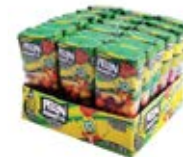
Pelon Pelonetes 18ct CODE: CAN87