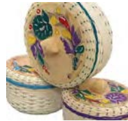
Tortilla Warmer CODE: HSW045