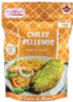
Don Chendo Chile Relleno CODE: DON105-2