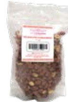
Don Chendo Peanuts Habanero lb CODE: DON095