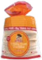
La Vikina Corn Tortilla