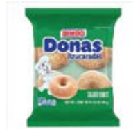
Bimbo Donas CODE: BKR011