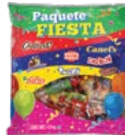
Canel's Paquete Fiesta 3.3lb CODE: CAN31