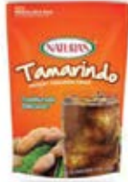
Naturas Tamarindo 12/12oz CASE CODE: BEV092