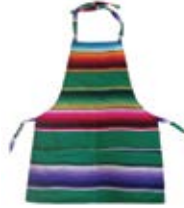
Mandil CODE: MSC010