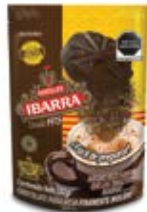
Chocolate Ibarra Granulada 12/11.5oz CODE: BEV015