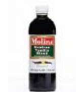
Vainilla Molina 1 12/1lt - SEA100 2 12/4.03oz - SEA101 3 12/8.3oz - SEA102