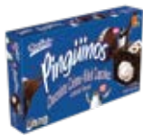
Pinguinos 8pcs CODE: BKR033