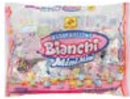
De la Rosa Mini Marshmallows 30pck CODE: CAN45