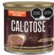
Cal C Tose 12/400g CODE: BEV009