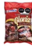
Providencia Glorias 15pcs CODE: CAN166