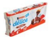
Kinder Chocolate Delice 10ct CODE: CAN246