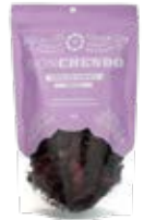
Don Chendo Hibiscus - Jamaica 10/100g CASE CODE: BEV033-3