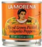
La Morena Jalapeno Sliced ① 12/13oz - JAL024 ② 12/28oz - JAL025 ③ 24/7oz - JAL026