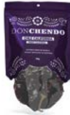
Don Chendo Chile California 10/ 60g CASE CODE: CHL005-6