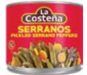
La Costena Serrano 12/12oz CODE: JAL019