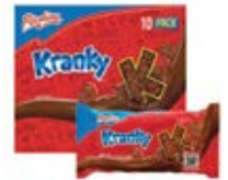
Kranky 10/40g CODE: CAN51