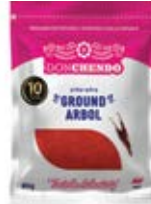
Don Chendo Ground Arbol 10/80g CASE CODE: SEA046-2