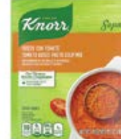
Knorr Soup Pasta Fideo