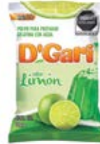
D'Gari gelatina Lime 24/170g CODE: GRO024