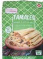
Don Chendo Chicken Tamal Green CODE: DON068-2