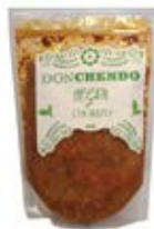
Don Chendo Vegan Chorizo 1 lb CODE: DON106