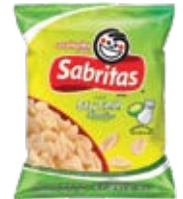
Sabritas Peanuts Sal y Limon 12/198g CODE: SNK060