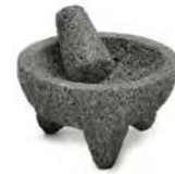
Molcajete 1 Large - HSW090 2 Medium - HSW030