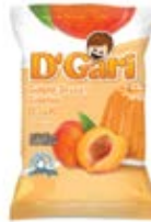
D'gari Gelatin Peach 24/4.2oz CODE: BEV195