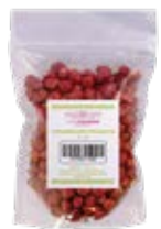
Don Chendo Caramelized Peanuts lb CODE: DON101