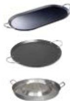
Comal 1 Oval - HSW086 2 Redondo Med - HSW005 3 Sombrero Med - HSW079