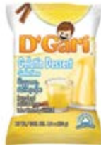
D'Gari gelatina Eggnog 24/170g CODE: GRO020