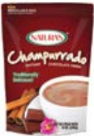
Naturas Champurrado 12/12oz CASE CODE: BEV087