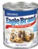
Condensed Milk Eagle Brand 24/300ml CODE: GRO088