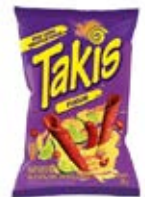
Takis Fuego 1 12/280g - SNK063 2 18/90g - SNK064