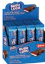
Bubulubu 24pcs CASE CODE: CAN20