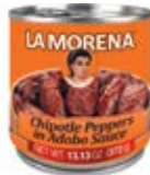
La Morena Chipotle Peppers ① 12/13oz - CHP008 ② 24/7oz - CHP010