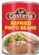
La Costena Refried Pinto 12/20oz CODE: BEN008