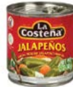
La Costena Jalapeno Whole ① 12/12oz - JAL014 ② 12/26oz - JAL015 ③ 24/7oz - JAL016