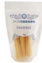
Don Chendo Churros 10/175g CODE: DON127