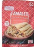
Don Chendo Chicken Tamal Red CODE: DON070-2