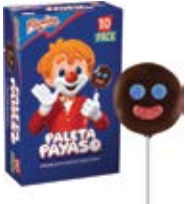
Ricolino Paleta Payaso 10pcs CODE: CAN103