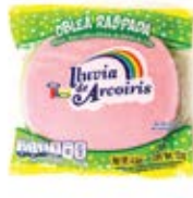
Arcoiris Oblea Mediana 125g CODE: CAN10