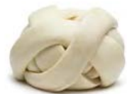
Oaxaca Cheese kg CODE: CHE001