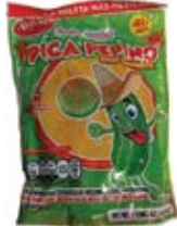
Alteno Pica Pepino 40pcs CODE: CAN156