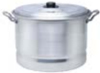
Olla 1 Large - HSW070 2 Medium - HSW069