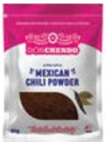
Don Chendo Mexican Chili Powder 10/80g CASE CODE: SEA069-2