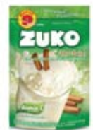
Zuko Horchata 12/400g CODE: BEV129