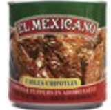
El Mexicano Chipotle Peppers 12/13.4oz CODE: CHP004