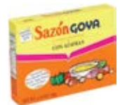
Goya Sazon con Azafran 36/1.41oz