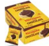
De la Rosa Mazapan Chocolate 16pcs CODE: CAN44