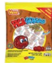
Vero Pica Tamarindo gummies 100pcs CODE: CAN128