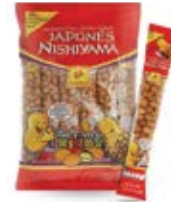
De la Rosa Japones 12/6pc CODE: SNK026