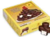
De la Rosa Bombon Chocolate 50pc CODE: CAN39