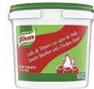
Knorr Sazonador Tomato 2kg CODE: SEA091