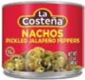
La Costena Jalapeno Nacho 12/12oz CODE: JAL010