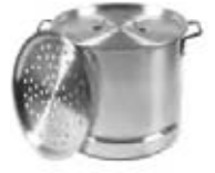
Tamalera 1 20 Qt - HSW037 2 24 Qt - HSW038 3 32 Qt - HSW039 4 40 Qt - HSW040 5 52 Qt - HSW041