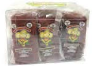
Super Leon Burrito 24pack