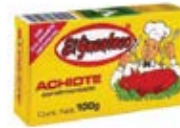
El Yucateco Achiote