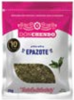
Don Chendo Epazote 10/25g CASE CODE: SEA026-3