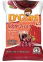
D'Gari gelatina Jerez 24/170g CODE: GRO023