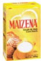
Maizena Natural 24/400g CODE: BEV079