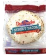
Don Pancho Street Taco Flour 12/12ct CODE: TOR013