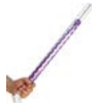
Pinata Stick CODE: HSW083