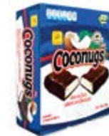
De la Rosa Chocolate Coconugs 12pcs CODE: CAN40