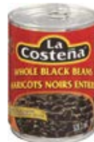
La Costena Whole Black 12/20oz CODE: BEN007