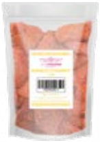
Don Chendo Mango Chamoy 1 lb CODE: DON054