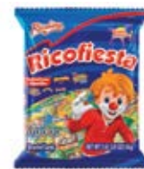
Ricolino RicoFiesta Pinatero 3.3lb CODE: CAN146