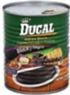
Ducal Black Refried bean