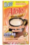
Klass Atole Guayaba 48/1.52oz CODE: BEV191