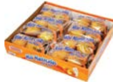
Bimbo Mini Mantecadas 8pcs CODE: BKR023