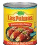
Las Palmas Red Sauce 12/28oz CODE: SAL033