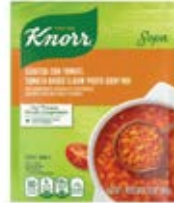
Knorr Soup Pasta Elbows