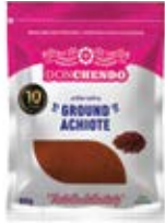
Don Chendo Ground Achiote 15/80g CASE CODE: SEA107-5