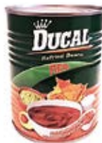
Ducal Red Refried bean