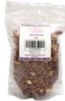
Don Chendo Peanuts lb CODE: DON090