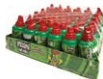
Pelon pelo Rico 36/28g CODE: CAN73