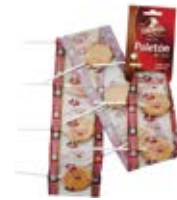
Coronado Paletón tira 10ct CODE: CAN37