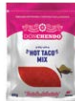
Don Chendo Hot Taco Mix 10/80g CASE CODE: DON042