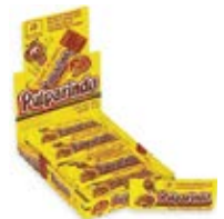
Pulparindo 20/14g 1 Regular - CAN93 2 Chamoy - CAN90 3 Extra Hot - CAN129 4 Mango - CAN91 5 Sugarfree - CAN190 6 Watermelon - CAN94