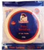
La Vikina Flour Tortilla 10" 10/10ct CODE: TOR026