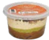
Don Chendo 7 layer Dip CODE: DON03