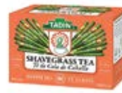
Tadin Te de Cola de Caballo 6/24ct CODE: GRO073