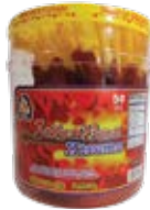
Banderilla Jabalina Xtreme 50pcs CODE: CAN135