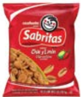
Sabritas Peanuts Chile y Limon 12/198g CODE: SNK059