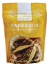
Don Chendo Barbacoa 450g CODE: DON002

Slow-cooked beef in a blend of peppers and spices known as adobo.