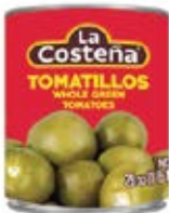
La Costena Whole Tomatillo 12/28oz CODE: TOM007