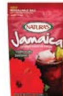
Naturas Jamaica 12/12oz CODE: BEV090