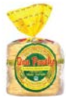
Don Pancho Corn Tortilla Yellow

1 16/30ct - TOR053 2 8/72ct - TOR057 3 Thin 12/54 - TOR015