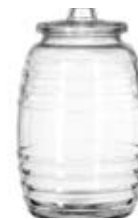
Vitrolero 1 Plastico 20L - HSW075 2 Small - HSW076