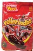
Vero Rellerindo 65ps CODE: CAN121