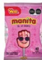
Vero manitas de la suerte 40pcs CODE: CAN131