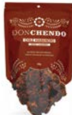
Don Chendo Chile Habanero 10/ 60g CASE CODE: CHL007-2