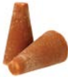
Piloncillo pc CODE: SEA077