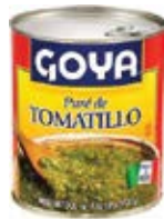
Goya Crushed tomatillos 12/26 oz CODE: TOM006