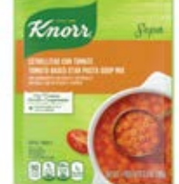
Knorr Soup Pasta Star