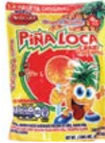
Alteno Pina Loca 40pcs CODE: CAN08