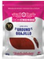
Don Chendo Ground Guajillo 10/80g CASE CODE: SEA052-3