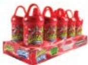
Lucas Muecas 10ct