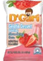
D'Gari gelatina MLK Strawberry 24/170g CODE: GRO026