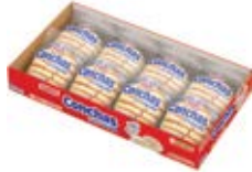
Bimbo Conchas 8pcs CODE: BKR009