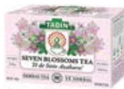
Tadin Te de Siete Azahares 6/24ct CODE: GRO077