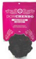
Don Chendo Chile Morita 15/ 60g CASE CODE: CHL008-6