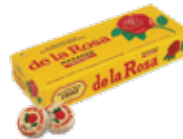
De la Rosa Mazapan 30pcs CODE: CAN43