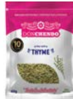
Don Chendo Thyme 10/40g CASE CODE: SEA099