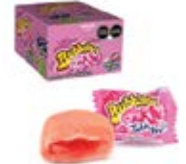
Bubbaloo bubblegum 50pcs 1 Banana - CAN14 2 Mint - CAN15 3 Mora Azul - CAN16 4 Pica Pina - CAN17 5 Strawberry - CAN18 6 Tutti Frutti - CAN19