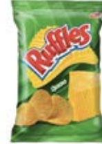
Ruffles 130g CODE: SNK057