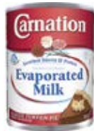
Carnation Evaporated Milk 24/354ml CODE: GRO087