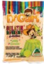
D'Gari gelatina Jarrito Lime 24/170g CODE: GRO022