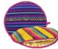
Tortilla Pocket CODE: HSW072