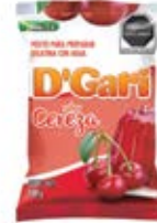
D'Gari gelatina Cereza 24/170g CODE: GRO017