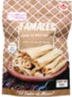
Don Chendo Pork Tamal Red CODE: DON069-2