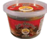
Mi pueblo Mole Rojo 10/500g