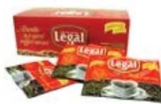
Cafe Legal Pouch 30/1oz CODE: BEV008