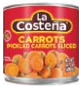
La Costena Carrots 12/14.1oz CODE: JAL009