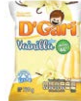
D'Gari gelatina Vainilla 24/170g CODE: GRO031