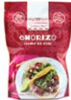
Don Chendo Chorizo Loose 450g CODE: DON098

Traditional Mexican sausage mixed with a blend of peppers and spices.