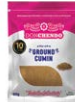
Don Chendo Ground Cumin 10/60g CASE CODE: SEA105-4