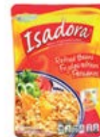
Isadora Peruano Refried Beans 8/15.2z CODE: BEN005