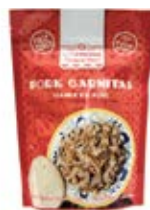
Don Chendo Carnitas 450g CODE: DON087

Tender pulled pork slow-cooked in its savory marinade and spices.