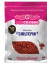
Don Chendo Chile Chiltepin 15/10g CASE CODE: CHL013-4