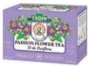
Tadin Te de Pasiflora 6/24ct CODE: GRO076