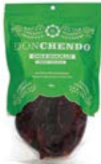
Don Chendo Chile Guajillo 15/ 60g CASE CODE: CHL002-6