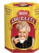
Chocolate Abuelita 12/19oz CODE: BEV013