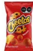
Cheeto Bola 110g CODE: SNK015