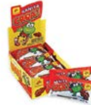
De la Rosa Chocolate Ranita Croa 12pcs CODE: CAN42