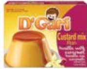
D'Gari Flan Caramelo 24/170g CODE: CAN49