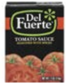
Del Fuerte Tomato Sauce 1 24/7.4oz - SAL001 2 12/1L - SAL047