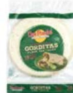
Don Pancho Flour tortilla 10" 12/8ct CODE: TOR058