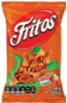
Fritos Chile y Limon 180g CODE: SNK030