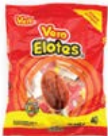
Vero Elotes 40pcs CODE: CAN119