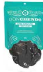
Don Chendo Chile Cascabel 10/ 60g CASE CODE: CHL014-5