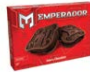
Gamesa Emperador Chocolate 12/6packs CODE: BKR015