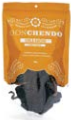
Don Chendo Chile Ancho 15/ 60g CASE CODE: CHL003-6