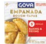
Goya Tapa para empanada 16/12oz FROZEN** 1 Criolla - SOM026 2 Hojaldradas - SOM027