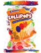
Canel's Fiesta Lollipop 100ct CODE: CAN200