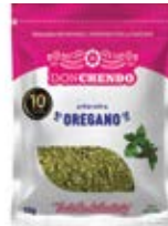
Don Chendo Oregano 10/15g CASE CODE: SEA070-3