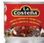
La Costena Chipotle peppers ① 12/12oz CASE - CHP006 ② 24/7oz CASE - CHP007-2