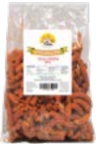
Mi Pueblo Churriscos 36/250g CODE: SNK215