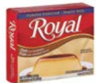
Royal Flan Caramelo 12/5.5z CODE: BKR039