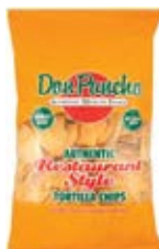
Don Pancho Restaurant Style