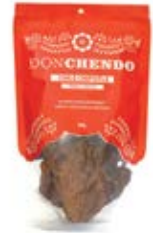
Don Chendo Chile Chipotle 15/ 60g CASE CODE: CHL006-2