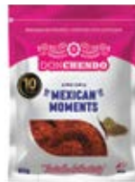
Don Chendo Mexican Moments 10/80g CASE CODE: DON050