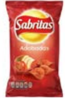
Sabritas Adobadas 105g CODE: SNK058