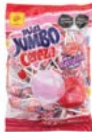
De La Rosa Paleta Cereza 24pcs CODE: CAN46