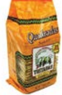
Los Pericos Square Tostada