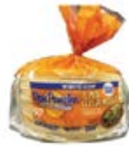
Don Pancho Corn Tortilla Grande