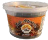
Mi pueblo Mole 10/500g