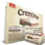
Nutresa Cremino Blanco 24ct CODE: CAN86