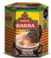
Chocolate Ibarra 12/19z CODE: BEV016