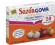
Goya Sazon Ajo y Cebolla 18/3.52oz