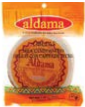
Aldama Oblea Mediana 5pcs CODE: CAN04