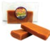
Peke Caramel Candy 16pcs CODE: CAN207