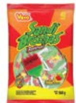
Vero SandiBrocha 40pcs CODE: CAN132