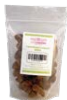
Don Chendo Tamarindo Chamoy 400g CODE: SNK070