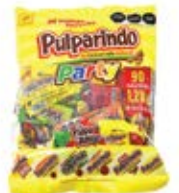
Pulparindo Party Mix 1.2kg CODE: CAN149