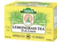
Tadin Te de Limon 6/24ct CODE: GRO074