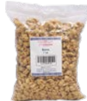
Soya Natural 1 lb CODE: GRO091