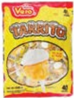
Vero Tarrito 40 pcs CODE: CAN125