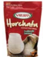
Naturas horchata 1 12/14oz CASE - BEV088 2 25Lbs - BEV089