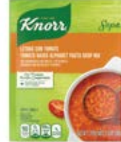
Knorr Soup Pasta Alphabet