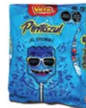
Vero Pintazul 48pcs CODE: CAN148