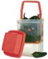
Jalapeño Container CODE: HSW082