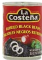
La Costena Refried Black 12/20oz CODE: BEN014