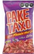
Pake Taxo Xtra Flamin Hot 215g CODE: SNK086