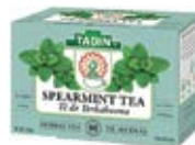
Tadin Te de Yerbabuena 6/24ct CODE: GRO079