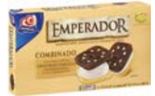
Gamesa Emperador Combinado 12/6packs CODE: BKR044