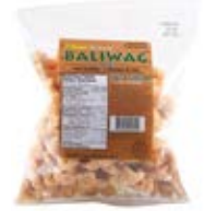
Mang Ramon Chicharron 24/85g CASE CODE: SNK053