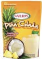
Naturas Pina Colada 12/12oz CASE CODE: BEV091