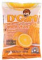
D'Gari gelatina Orange 24/170g CODE: GRO027