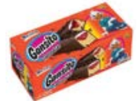
Gansito Cake 24pcs CODE: BKR019