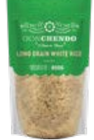
Don Chendo Rice 10/800g CASE CODE: GRO066-4