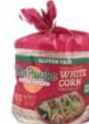
Don Pancho Corn Tortilla White