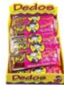
Indy Dedos tamarindo 12pcs CODE: CAN50