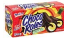
Chocoroles 8pcs CODE: BKR061