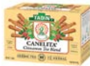
Tadin Te de Canela 6/24ct CODE: GRO072