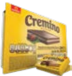
Nutresa Cremino Bicolor 24ct CODE: CAN143