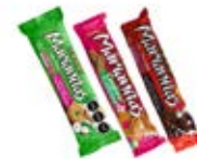
Marianitas 20/6.5oz 1 Pecan - SOM012 2 Chocolate - SOM013 3 Coconut - SOM014