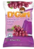
D'Gari gelatina Uva 24/170g CODE: GRO030