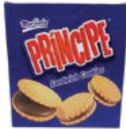
Marinela Principe 12pc CODE: BKR036