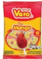
Vero Mango 40pcs CODE: CAN120