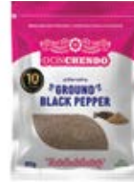
Don Chendo Ground Black Pepper 10/80g CASE CODE: SEA047-2