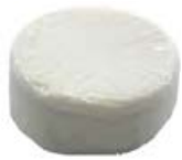
Asadero Cheese kg CODE: CHE004