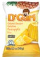
D'Gari gelatina Pineapple 24/170g CODE: GRO028