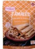
Don Chendo Tamal Poblano & Cheese CODE: DON072-2