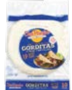
Don Pancho Flour Tortilla 8" 15/8ct CODE: TOR055