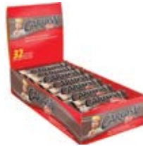
Chocolate Carlos V 32pcs CODE: CAN34