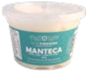
Don Chendo Lard-Manteca 400g CODE: DON045-2