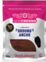
Don Chendo Ground Ancho 10/80g CASE CODE: SEA045