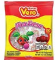
Vero Pica Fresa gummies 100pcs CODE: CAN127