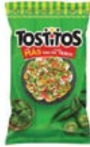
Tostitos 1 Regular 200g - SNK071 2 Regular 25/65g - SNK072 3 Flaming 200g - SNK073