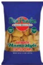
Don Pancho HomeStyle Chip