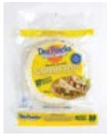
Don Pancho Flour Tortilla 6" 12/16ct CODE: TOR059