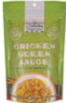
Don Chendo Chicken Green Sauce 450g CODE: DON117