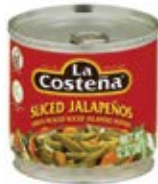
La Costena Jalapeno Sliced ① 12/12oz - JAL012 ② 12/28oz - JAL022 ③ 24/7oz - JAL013