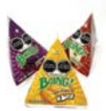
Boing Triangle 3/6/200ml CASE CODE: BEV004