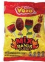
Vero Banda Mix 40pcs CODE: CAN133