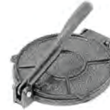
Tortilla Press CODE: HSW055