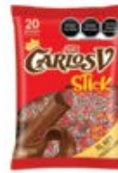
Carlos V Stick 20pcs CODE: CAN32