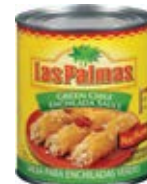
Las Palmas Green sauce 12/28 oz CODE: SAL032