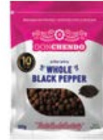
Don Chendo Whole Black Pepper 10/50g CASE CODE: DON010-1