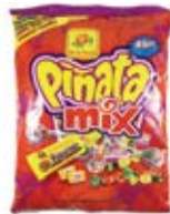
De la Rosa Pinata Mix 4lb CODE: CAN47