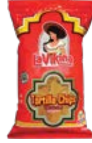
La Vikina Tortilla Chips