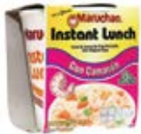
Maruchan Soup 12/2.25oz