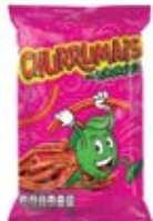
Churrumais 200g CODE: SNK021