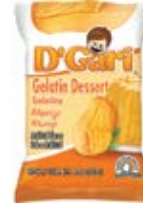
D'Gari gelatina Mango 24/170g CODE: GRO025