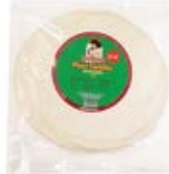
La Vikina Flour Tortilla 12" 12/10ct CODE: TOR027