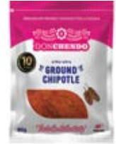
Don Chendo Ground Chipotle 10/80g CASE CODE: SEA049-2