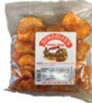
La Placita Potato Chips Chile 71g CODE: SNK050