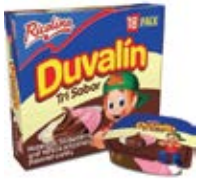
Ricolino Duvalin 18pcs