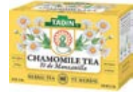
Tadin Te de Manzanila 6/24ct CODE: GRO075