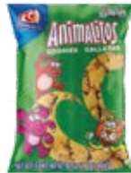
Gamesa Animalitos 12/16oz CODE: SNK207