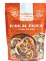
Don Chendo Pastor 450g CODE: DON088

Slow-cooked pork in pineapple juice, vinegar, and spices.