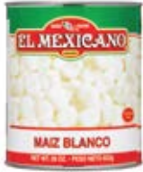
El Mexicano Hominy