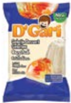
D'Gari gelatina Crystal 24/170g CODE: GRO019