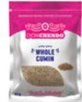
Don Chendo Whole Cumin 15/60g CASE CODE: SEA105