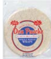
Don Pancho Flour Tortilla 13" 10/10ct CODE: TOR009