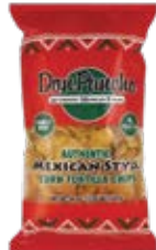
Don Pancho Mexican Style