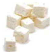
Cotija Cheese kg CODE: CHE002