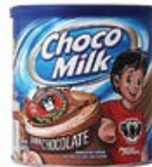
Choco Milk Pancho Pantera 12/400g CODE: BEV011