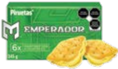
Gamesa Emperador Limon 12/6packs CODE: BKR016