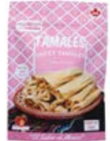
Don Chendo Tamal Sweet CODE: DON071