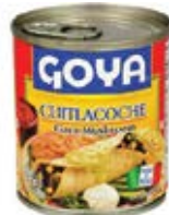
Goya Huitlacoche 12/7oz CODE: SEA031