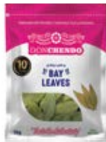
Don Chendo Bay Leaves 10/15g CASE CODE: DON003