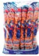
Arachi Japones 10/180g CODE: SNK002