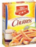
Tres Estrellas Churros Flour 12/17.6oz CODE: FLR001