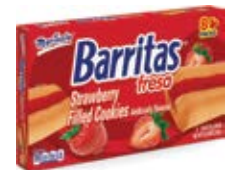
Barritas Strawberry 8 pack CODE: BKR002-2