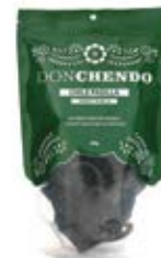
Don Chendo Chile Pasilla 15/ 60g CASE CODE: CHL010-5