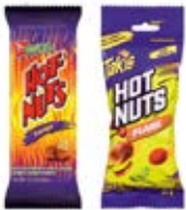
Barcel Hot Nuts Flare 12/90g 1 Original - SNK011 2 Fuego - SNK010