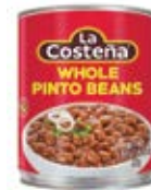
La Costena Whole Pinto 12/20oz CODE: BEN009