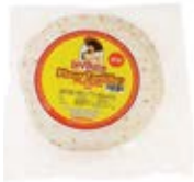
La Vikina Flour Tortilla 6" 24/12ct CODE: TOR030