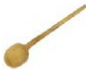
Paddle (Pala) CODE: HSW085