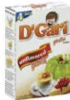
D'Gari gelatina Unflavored 24/28g CODE: GRO029