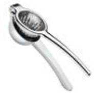
Lime Squeezer Reg CODE: HSW011