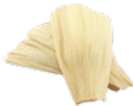
Hoja para Tamal 16oz CODE: MSC009