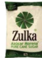
Zulka Cane Sugar ① 10/2lb - GRO099 ② 5/8lb - GRO100