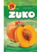
Zuko Peach 12/400g CODE: BEV133