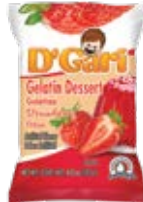
D'Gari gelatina Strawberry 24/170g CODE: GRO021