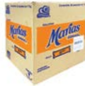
Galletas Marias Rollos 24/4.9oz CODE: BKR014