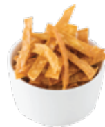
Tortilla Soup Strips