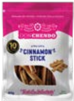
Don Chendo Cinnamon Stick 10/40g CASE CODE: SEA015-2