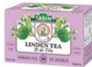
Tadin Te de Tila 6/24ct CODE: GRO078