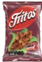
Fritos Chorizo 180g CODE: SNK031