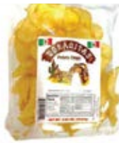
La Placita Potato Chips 71g CODE: SNK049