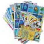
Loteria 20 Tablas CODE: HSW024