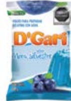
D'Gari gelatina Blueberry 24/170g CODE: GRO016